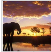
Lavish Refurbishments at Camp Kazuma

Posted by Editor on September 24, 2015. Filed under Articles , Tourism . You can follow any responses to this entry through the RSS 2.0 . You can skip to the end and leave a response. Pinging is currently not allowed.