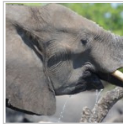
Green Gathering for Botswana's 50th